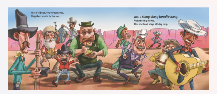
THIS OLD BAND first spread illustrated by Matt Loveridge.

Make sure each group comes up with their sound. What does a boodle bang sound like? Etc. What do their instruments sound like? Using classroom objects, have students try to replicate the sound and create the various songs.